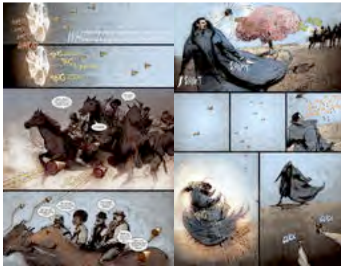
Pages from "Hatter M: Mad With Wonder"