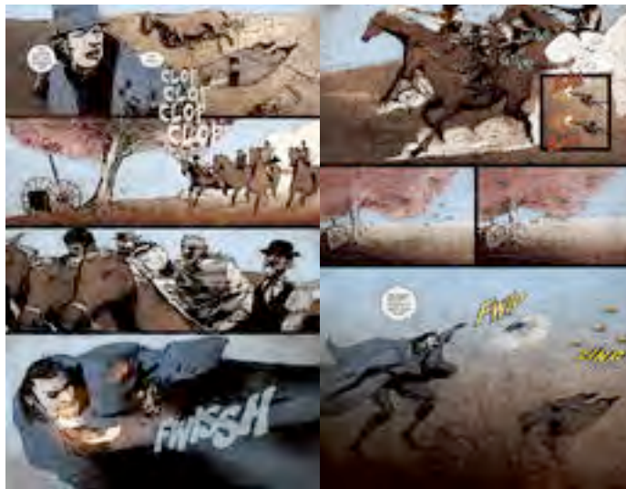
Pages from "Hatter M: Mad With Wonder"